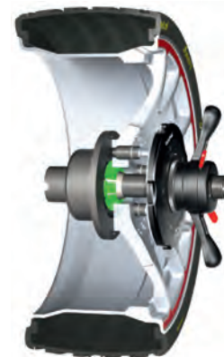
Application of the ProGrip on the wheel (in combination with QuickPlate and DuoExpert)