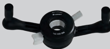
ProGrip with handles