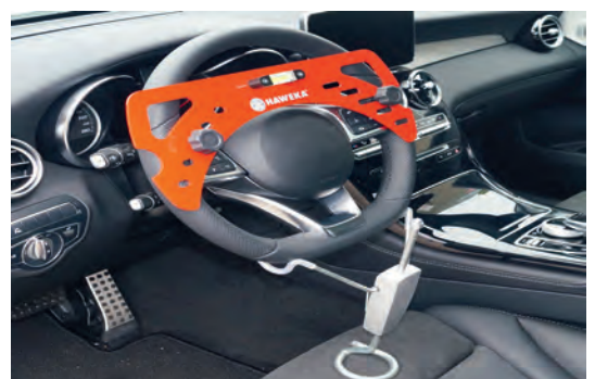
Use of the steering wheel scale and lock.