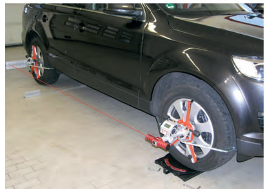
Example of a front axle measurement.