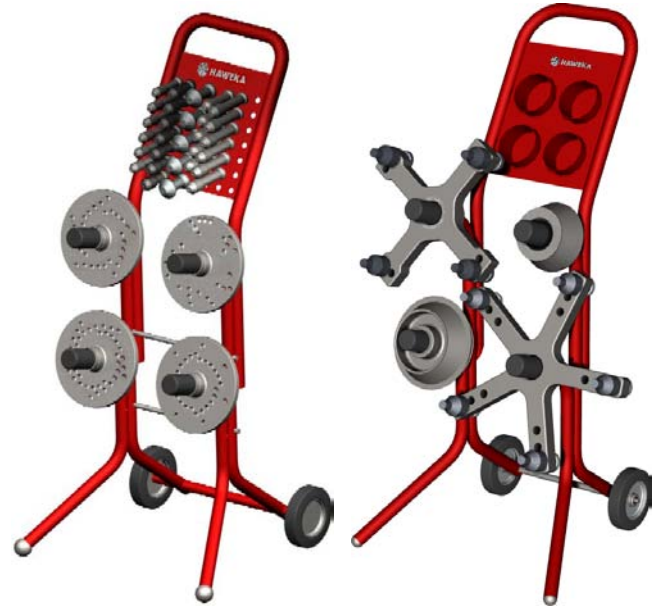
e.g. for passenger cars

Flange Plate Storage Facility for Truck Centring Stars and Cones with tray e.g. for Centring Sticks.